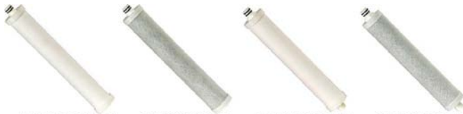
14-RS23SED5 14-RS23CB5 14-RS22SED5 14-RS22CB5